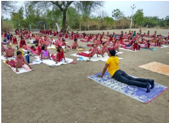
Yoga Day celebration at one of the government schools