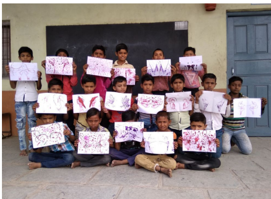
Students showcasing their work at the camp

Considering the local sanitation and health needs, Cosmo Foundation extended its support by constructing 31 toilets with hand washing facility across eight rural government primary and grant in aid schools in Karjan. This initiative would benefit around thousand girls and women teachers of the schools. Cosmo has also provided cleanliness material, hygiene kit and maintenance manual to the school authorities to maintain hygiene in the toilets.